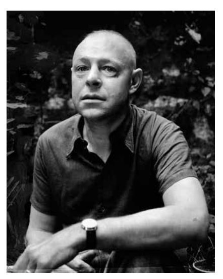
Jean Dubuffet rue de Vaugirard, ca 1946, Photo: © J. Cordier /Archives Fondation Dubuffet, Paris

PRESS BREAKFAST: January 25, 2017, 10 a.m.