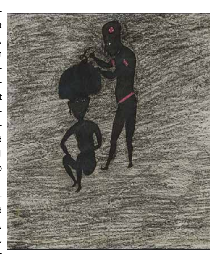
rican continent as well, and had Somuk, ohne Titel, n.d. Black pencil and colored ink on paper 23 × 21cm works sent to him from coun-

In his search for new, uninfluenced art Dubuffet travelled through European countries, such as Switzerland, Belgium, and France, but also to the Af-