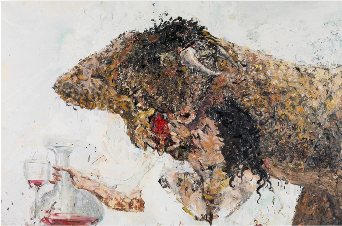
Fabian Cerredo, Minotaurus bietet seiner Schönen sein Herz an, 2003 © Bildrecht, Wien 2017, Fonds de l'Abbaye d'Auberive