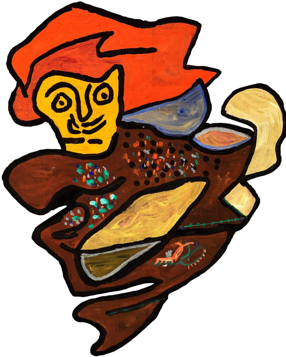
Gaston Chaissec, Ohne Titel, ca. 1960 © Bildrecht, Wien 2017, Fonds de l'Abbaye d'Auberive